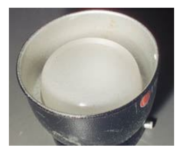
This is the Norman 5 inch reflector and the glass dome.