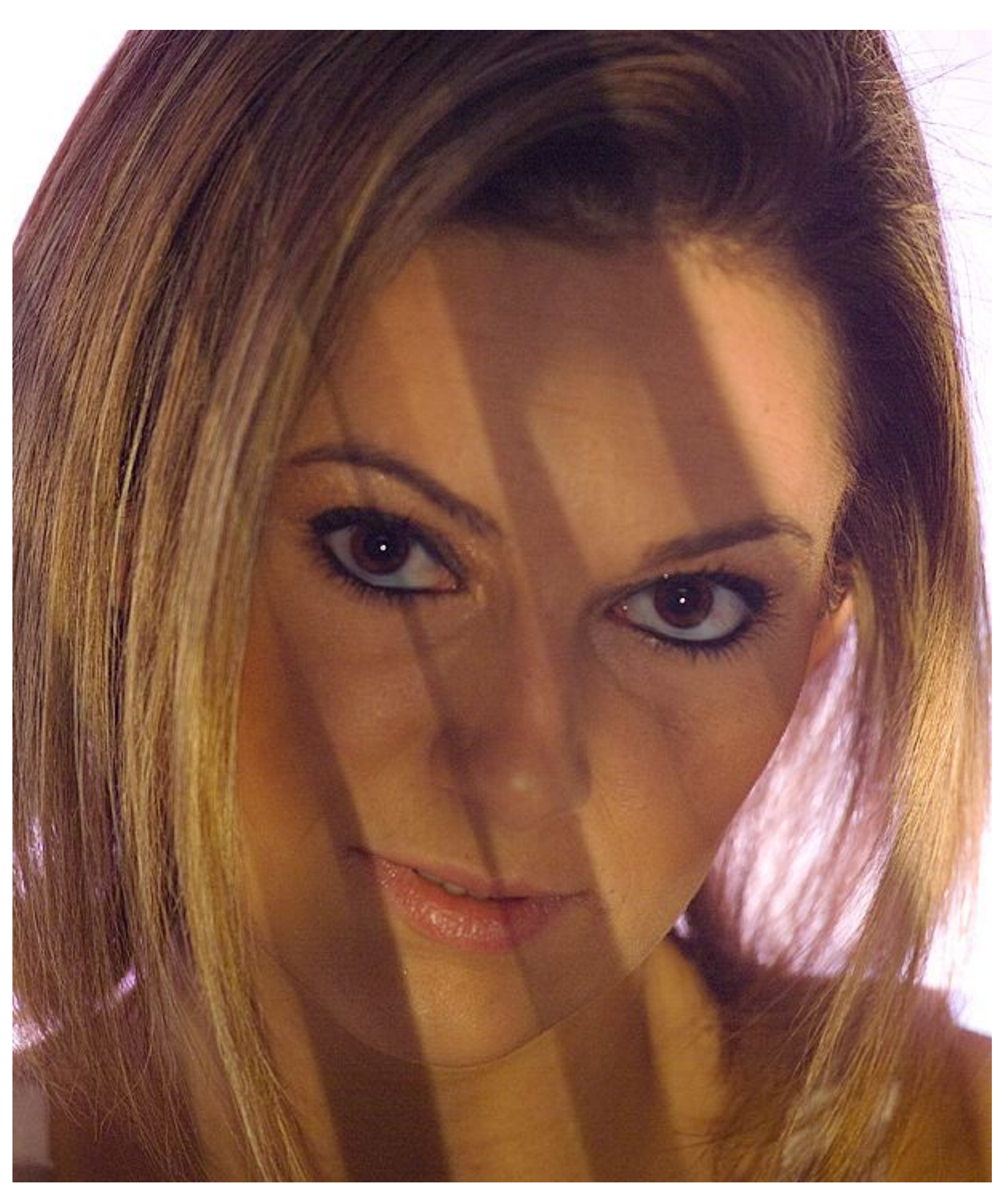
I use a cookie, or coculoris, with lines cut into it to illuminate the face. You can design any pattern you want into a cookie. So you can project window or stars or lines. I really like the effect of this simple design.