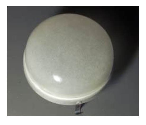
The Norman glass dome. Without this dome you would be projecting an image of the strobe tube.