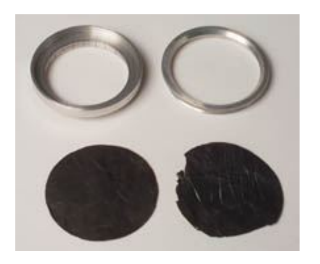
This is the filter holder and a couple of cookies. The one on the left hasn't been cut yet.