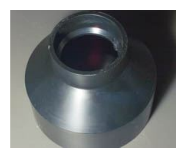
This is a plumbing part. It fits into the Norman reflector and holds the Kodak lens.

There is another way to control light, which can offer very special effects. We can use a lens and project the light. This enables us to put light in a very small area of a shot, or put light with a very sharp edge into a shot. This means you could make a spot that was only a millimeter across. You could make a spot or pattern with a hard edge. You can also project images into a shot. Essentially you do the reverse of what you do with a camera. In a camera the light from a subject comes through a lens and onto a sensor. If the lens is right then the