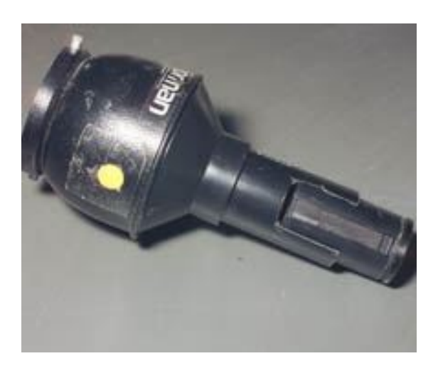
The finished projector. It fits on a Norman LH2400 head.