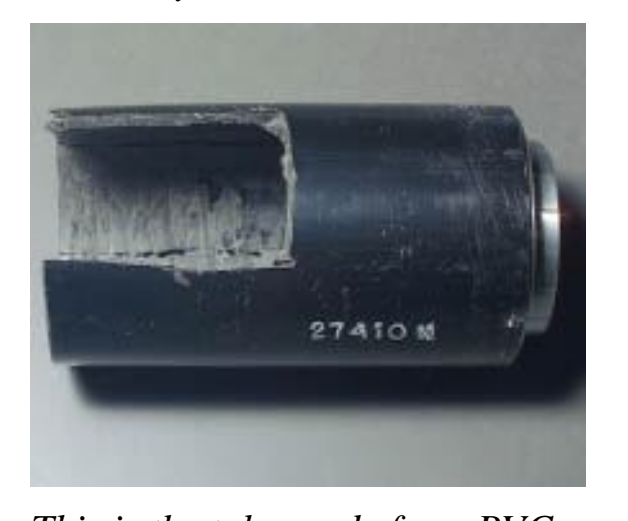
This is the tube made from PVC pipe. This is the heart of the device. You can see how the filter holder fits on the back.

because heat is a problem. I cut a nail down to about 1/2 inch. I made a hole to insert the nail from the reflector into the step-down pipe. This keeps the step-down pipe from falling out of the reflector. Then I made some cuts, detailed below, in the 2.25-inch pipe to accommodate a 4-inch focal length lens from a Kodak projector. The Kodak lens for a Carousel Projector is a good lens for this project, as it is inexpensive and pretty bright. The focus on this lens can be adjusted by moving it inside the 2.25-inch pipe.